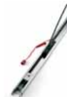
AFE01 1 pc.