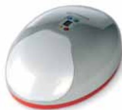
FE80RES 1 pc.